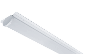
JLSRETLED SERIES 23W/46W 4' & 8' Covered Strip Retrofits 3500K, 4000K, 5000K (8' Strips NOT Freight Allowed)