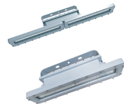
SUN SERIES 24" & 48" Class 1 Division 1 Battery Backup Available