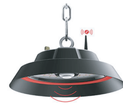
LTZ SERIES 100W/150W/190W Integrated Control LED High Bay (Multiple reflector options available)