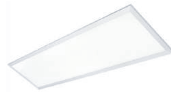
APM1X4-35W 35W 1'x4' DLC Premium LED Flat Panel 3000K, 3500K, 4000K, 5000K