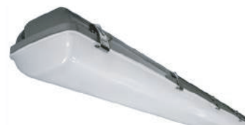
VTHLED SERIES 35W/40W/52W DLC Premium Vapor Tight 3500K, 4000K, 5000K (Occupancy Sensor option available)