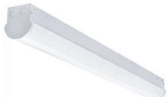
JLSLED SERIES 20W/25W/32W/65W 2', 3', 4' & 8' Covered Strips 3500K, 4000K, 5000K (8' Strips NOT Freight Allowed)