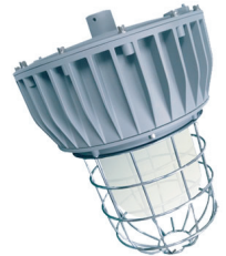
SPACE SERIES 40W/60W/80W Class 1 Division 1 Available with or without globe 4000K, 5000K