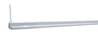
LUCY SERIES 40W 4000K 4,200lm LED Shop Light