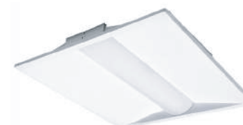
CCMLED22-32W-PRM-CP 32W 2'x2' DLC Premium Low-Profile Center Basket 3000K, 3500K, 4000K, 5000K