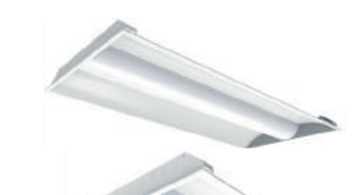
CCMLED22/24 22W, 33W, 42W 2'x2' & 2'x4' DLC Premium Center Basket Retrofits 3500K, 4000K, 5000K