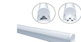
DEW SERIES (LED WATTAGE VARIES BY SIZE) 4', 8' or 12' Linear Integrated Fixture 3000K, 3500K, 4000K, 5000K