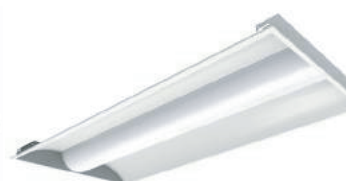
CCMLED24-40W 40W 2'x4' DLC Premium Center Basket 3000K, 3500K, 4000K, 5000K