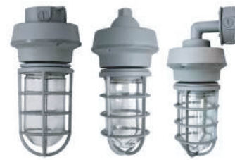
JJ SERIES 10W J-Box, Pendant or Wall Mount Vaporproof 4000K, 5000K