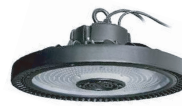
VICO SERIES 100W/150W/200W/240W Round High Bay 4000K, 5000K (Multiple reflector options available)