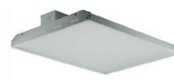
PDM SERIES 90W/135W/178W DLC Premium Full-Body High Bay 4000K, 5000K