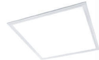
APM2X2-32W 32W 2'x2' DLC Premium LED Flat Panel 3000K, 3500K, 4000K, 5000K