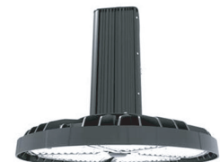
QUAKER SERIES 300W/400W/460W 3G Vibration Tested 20kv Surge Protection