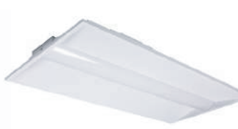
CCMLED24-40W-PRM-CP 40W 2'x4' DLC Premium Low-Profile Center Basket 3000K, 3500K, 4000K, 5000K