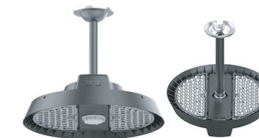
LZ SERIES 75W-300W Indirect Uplight Title 24 Compliant