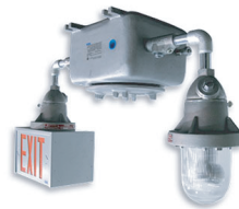
HATTERAS COMBO Class 1 Division 1 Exit & Emergency Combo