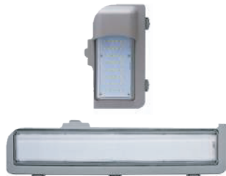
TSW/TSWXP SERIES 22W/37W/47W/66W/112W/136W 12" / 24" / 48" Die-Cast Linear 4000K, 5000K (Explosion proof and non-explosion proof available)