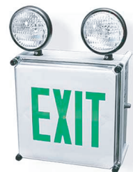
CARDIFF COMBO NSF Certified NEMA 4X BAA Compliant