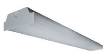
WRAP4FT 40W 4" Wrap Ceiling Fixture 3500K, 4000K, 5000K