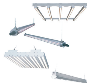
DREW SERIES Contact for a list of FME LED grow lights