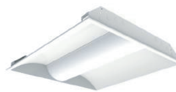
CCMLED22-30W 30W 2'x2' DLC Premium Center Basket 3000K, 3500K, 4000K, 5000K